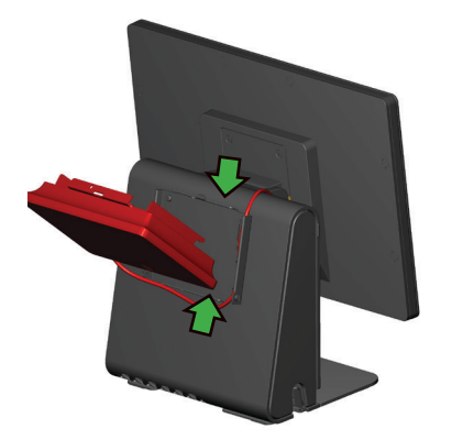
Hook the rear facing display bracket onto the AiO bracket and secure using 1 M3 screw (included in the kit) on either the top or bottom (marked by green arrows) of the bracket.