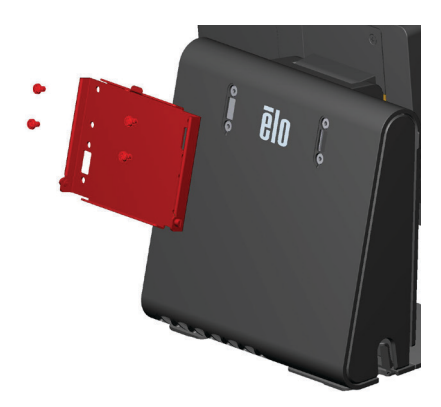
Remove the mounting screw covers from the back of the AiO and attach the bracket using the 4 screws included with the kit.